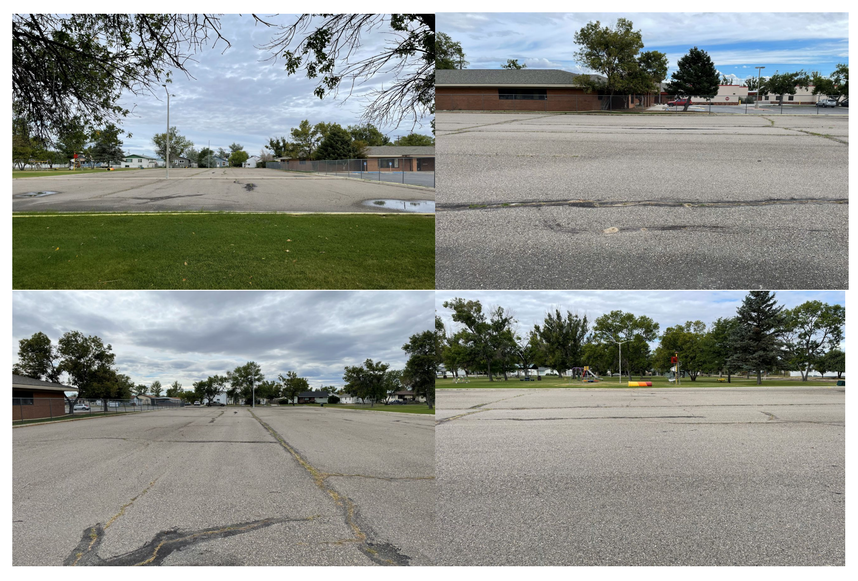
South Park Splash Pad Project Location, City of Hardin MT, 59034